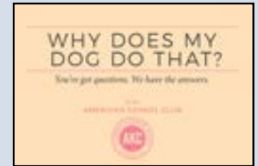
WHY DOES MY DOG DO THAT?