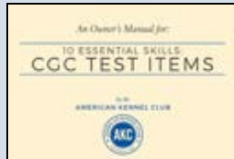
10 ESSENTIAL SKILLS: CGC TEST ITEMS