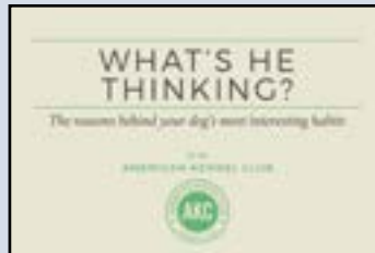
WHAT'S HE THINKING?