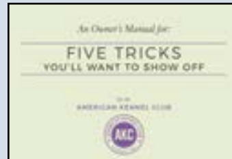
FIVE TRICKS YOU'LL WANT TO SHOW OFF