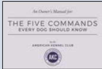
THE FIVE COMMANDS EVERY DOG SHOULD KNOW

We hope this information was valuable to you in helping your puppy live a long, healthy, happy life. Below, find additional books in our Owner's Manual series designed to strengthen the bond between you and your furry family member.