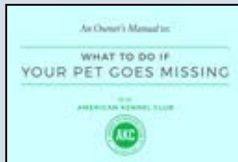
WHAT TO DO IF YOUR PET GOES MISSING