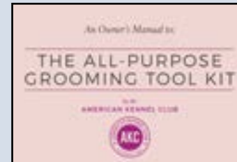
THE ALL-PURPOSE GROOMING TOOL KIT