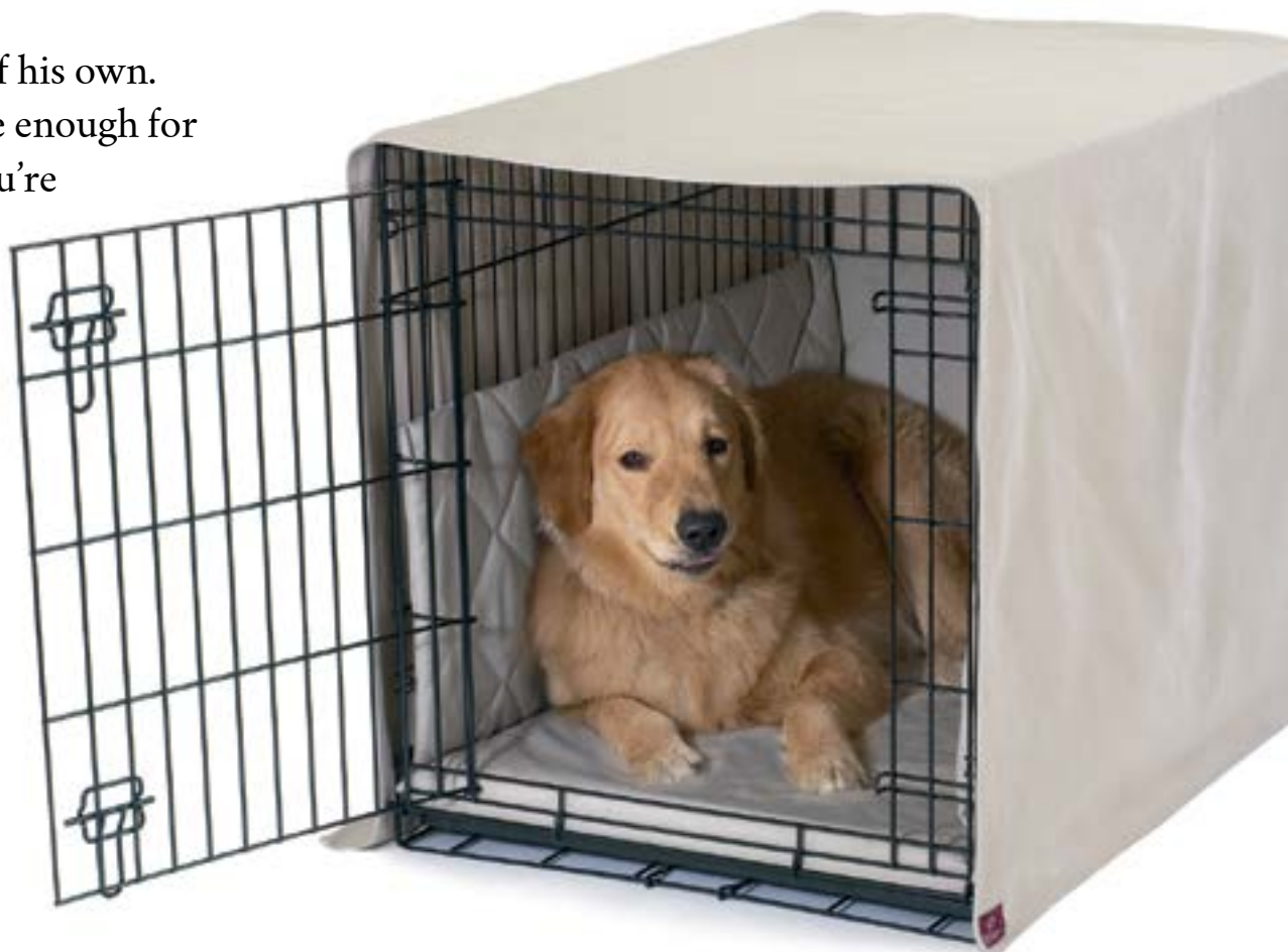
Golden Retriever

Basically, you're giving your dog a room of his own. By keeping your dog in a crate that is large enough for him to stand up and turn around while you're away or sleeping, you'll help housebreak him and give him a space to feel safe and protected. Plus, you'll fill it with toys and bedding, so he'll feel extra cozy—kind of like a playpen for a baby.