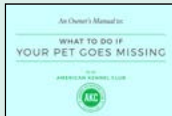
WHAT TO DO IF YOUR PET GOES MISSING