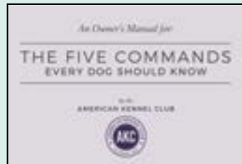
THE FIVE COMMANDS EVERY DOG SHOULD KNOW