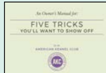
FIVE TRICKS YOU'LL WANT TO SHOW OFF