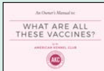
WHAT ARE ALL THESE VACCINES?