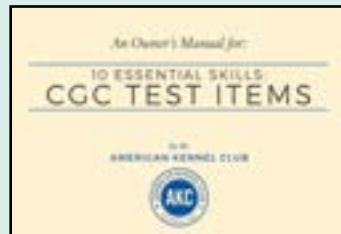
10 ESSENTIAL SKILLS: CGC TEST ITEMS