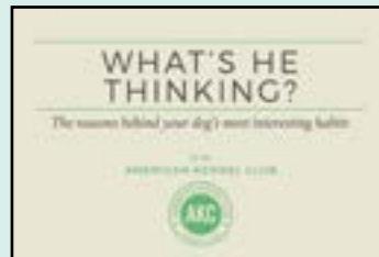
WHAT'S HE THINKING?