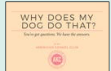
WHY DOES MY DOG DO THAT?