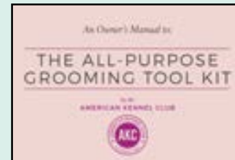
THE ALL-PURPOSE GROOMING TOOL KIT