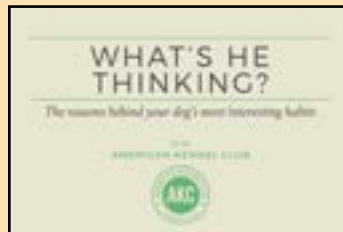
WHAT'S HE THINKING?