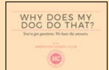
WHY DOES MY DOG DO THAT?