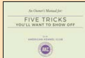
FIVE TRICKS YOU'LL WANT TO SHOW OFF