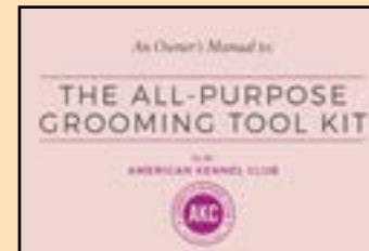
THE ALL-PURPOSE GROOMING TOOL KIT