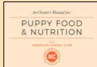
PUPPY FOOD & NUTRITION