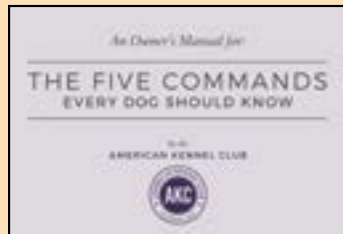
THE FIVE COMMANDS EVERY DOG SHOULD KNOW

We hope this information was valuable to you in helping your puppy live a long, healthy, happy life. Below, find additional books in our Owner's Manual series designed to strengthen the bond between you and your furry family member.