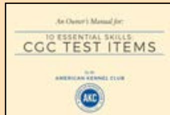
10 ESSENTIAL SKILLS: CGC TEST ITEMS