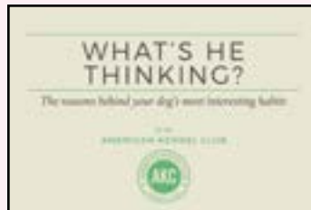
WHAT'S HE THINKING?