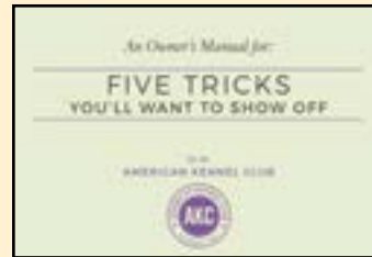
FIVE TRICKS YOU'LL WANT TO SHOW OFF