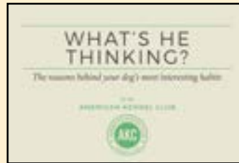
WHAT'S HE THINKING?