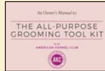
THE ALL-PURPOSE GROOMING TOOL KIT