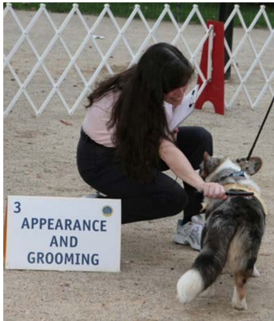
Mary Bloom ©AKC

This practical test demonstrates that the dog will welcome being groomed and examined and will permit someone, such as a veterinarian, groomer or friend of the owner, to do so. It also demonstrates the owner's care, concern and sense of responsibility. The evaluator inspects the dog to determine if it is clean and groomed. The dog must appear to be in healthy condition (i.e., proper weight, clean, healthy and alert). The handler should supply the comb or brush commonly used on the dog. The evaluator then softly combs or brushes the dog, and in a natural manner, lightly examines the ears and gently picks up each front foot. It is not necessary for the dog to hold a specific position during the examination, and the handler may talk to the dog, praise it and give encouragement throughout.