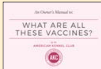
WHAT ARE ALL THESE VACCINES?