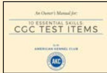
10 ESSENTIAL SKILLS: CGC TEST ITEMS