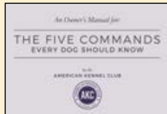
THE FIVE COMMANDS EVERY DOG SHOULD KNOW

We hope this information was valuable to you in helping your puppy live a long, healthy, happy life. Below, find additional books in our Owner's Manual series designed to strengthen the bond between you and your furry family member.