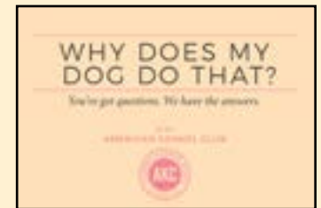
WHY DOES MY DOG DO THAT?