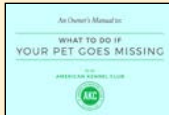
WHAT TO DO IF YOUR PET GOES MISSING