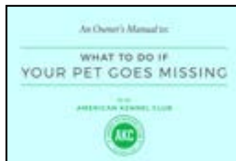
WHAT TO DO IF YOUR PET GOES MISSING