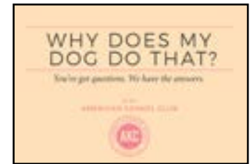
WHY DOES MY DOG DO THAT?