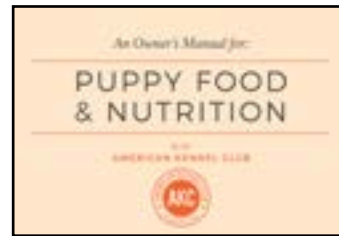
PUPPY FOOD & NUTRITION