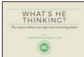
WHAT'S HE THINKING?