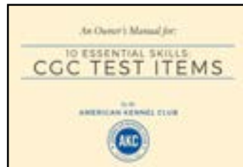
10 ESSENTIAL SKILLS: CGC TEST ITEMS