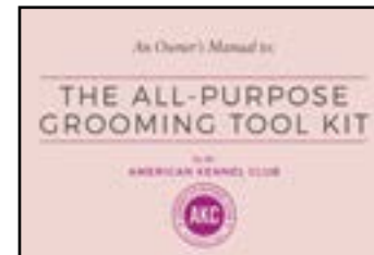
THE ALL-PURPOSE GROOMING TOOL KIT