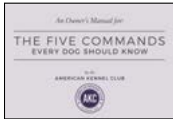
THE FIVE COMMANDS EVERY DOG SHOULD KNOW

We hope this information was valuable to you in helping your puppy live a long, healthy, happy life. Below, find additional books in our Owner's Manual series designed to strengthen the bond between you and your furry family member.