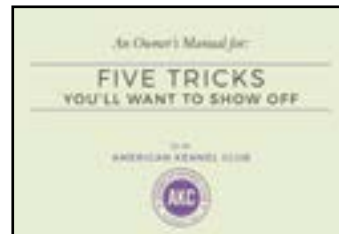
FIVE TRICKS YOU'LL WANT TO SHOW OFF